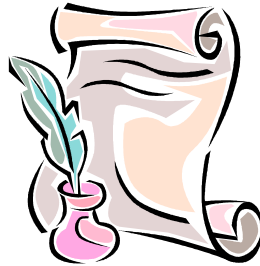
A list of all covenants can be found at www.TorreyPinesOmaha.com

Just to let everyone know, during 2004—2005 a total of 39 complains were filed with the board. Some of them did fall into covenant violations.