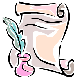
A list of all covenants can be found at www.TorreyPinesOmaha.com

The board has also noticed a number of other covenant violations related to article 1 section 11 "No fence shall be permitted to extend beyond the front line of a main residential structure. No fence shall be of the chain link or wire type." Therefore, if you have one we are asking that you remove it as soon as spring arrives.